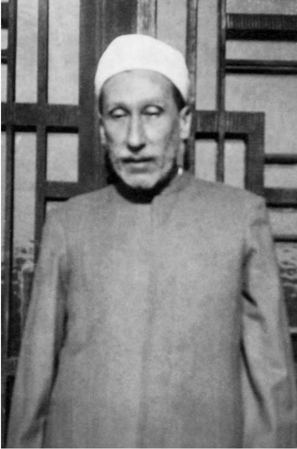
René Guénon in Egypt